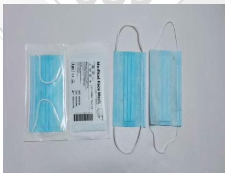
Photo of Samples